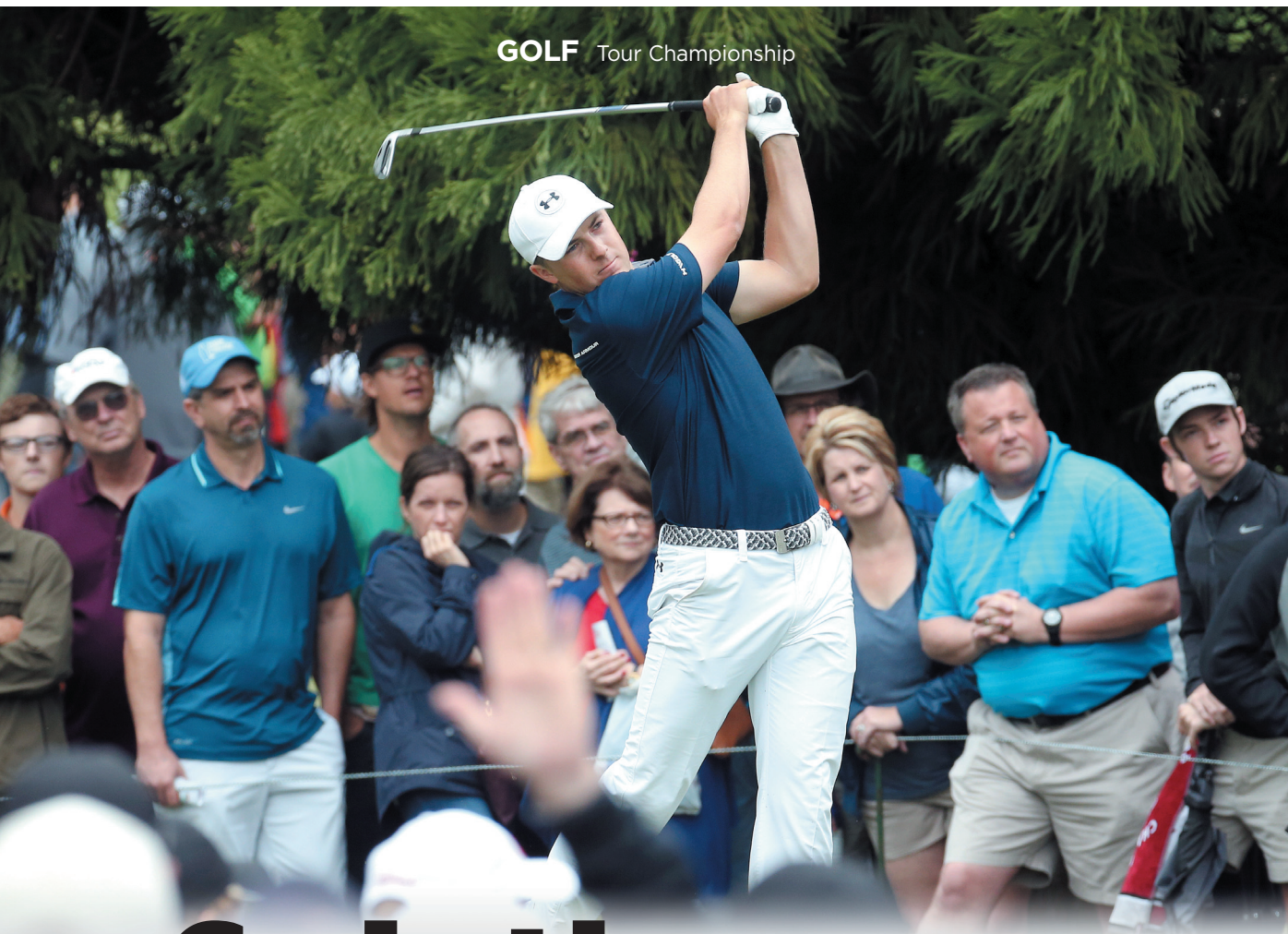
GOLF Tour Championship