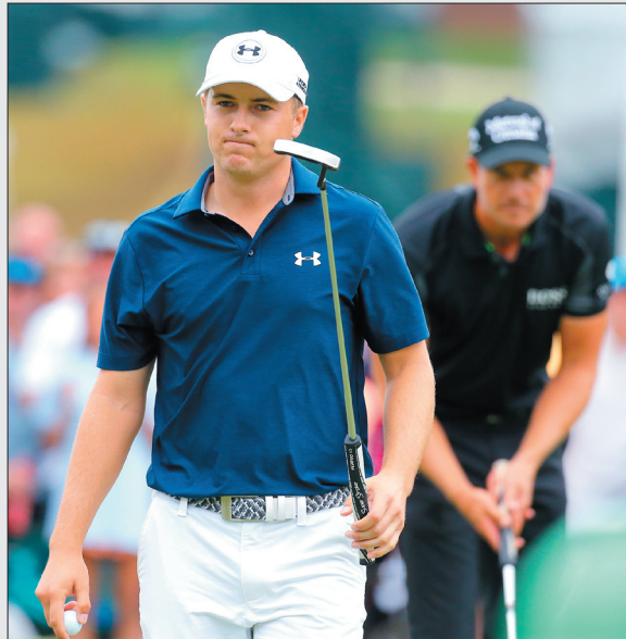
TOP: Jordan Spieth hits from the tee on the second hole in the final round of the Tour Championship on Sunday at East Lake Golf Club in Atlanta. RIGHT: Spieth makes a long birdie putt on the ninth hole with Henrik Stenson looking on.